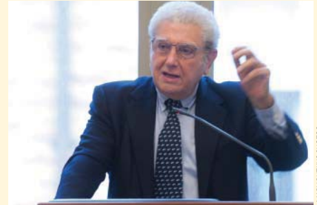
M. Cherif Bassiouni